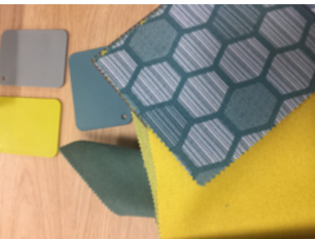
A selection of the finishes, colours and patterns that the new Level D will be furnished with.