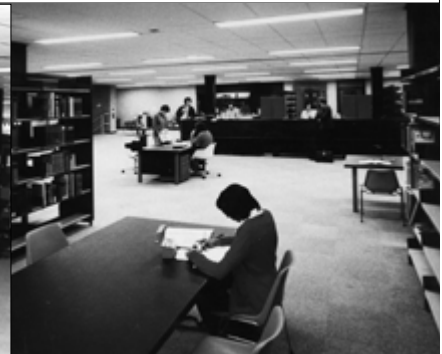
Hugh Owen Library in 1976, when reservations and lending services were on Level E.