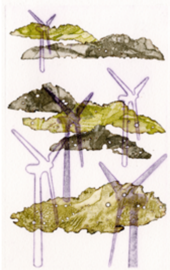
Faith Flower (Wales), Marginal Adjustments 2 , etching

Printmakers reflect on the way the "marginal" positions of the British and New Zealand archipelagos have influenced the representation of culture, society, remembered histories and landscape and how this has changed in the 21 st century.