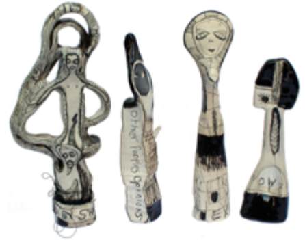
Terence Wilde, Embodiments