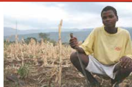
Drought conditions in Ethiopia

Full story: www.aber.ac.uk/en/news/archive/2013/09/title-140202-en.html