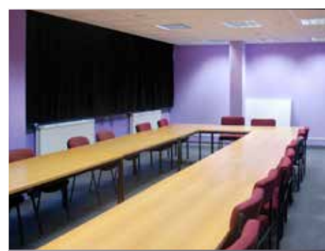
Refurbished teaching room, Hugh Owen Building

We've started with two projects over this summer. First, with guidance from our resident experts on learning spaces and learning technology, we've refurbished all the main teaching rooms in Hugh Owen. They're now