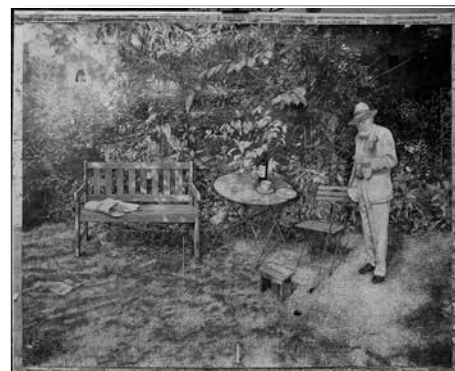
Presently Absent in an English Country Garden. Pencil drawing on cartridge paper with collaged and calibrated border, 5.05.2012-23.08.2013