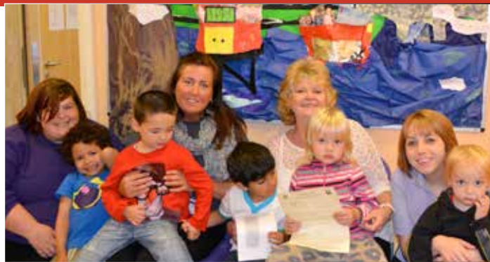
Staff and children at Penglais Nursery

The inspection report stated that "children feel happy and safe in the nursery" and that they "achieve well and make good progress from their starting point". The teaching was described as being of a "consistently good standard" and the inspector found that "the wide range of interesting and active experiences ensures the children enjoy their learning and engage in it enthusiastically".