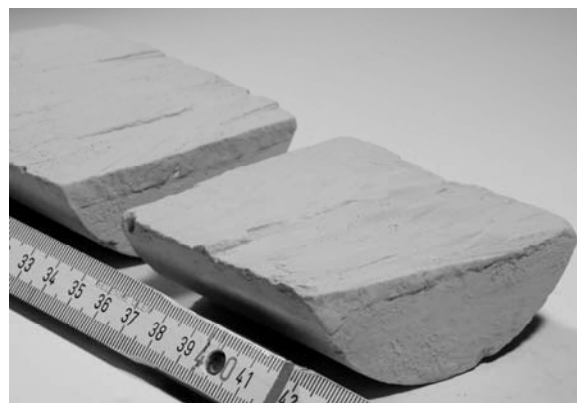
Figure 1: Azzano Decimo core, samples ADC18 and 19. Samples were between 8 and 20 cm in length, and only taken from those parts that remained completely consolidated.

A sedimentary core, drilled four years earlier in Azzano, northeastern Italy, was sampled for luminescence dating in 2006. The core was 260 m long, with the top lying only 9 m above sea level (a.s.l.), and composed of sand, silt and clay sediments, of which only the consolidated silty sediments were sampled (Fig. 1). As it had been exposed to air during storage almost all the water originally present had evaporated.